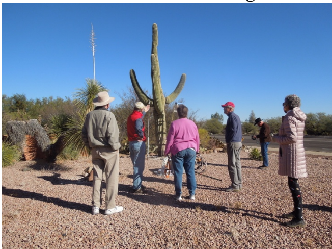
How do we do this???? It's been a year.....