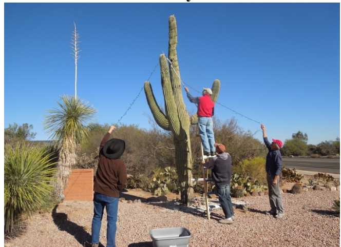
...but in fact they do finally have it down to a fine art!